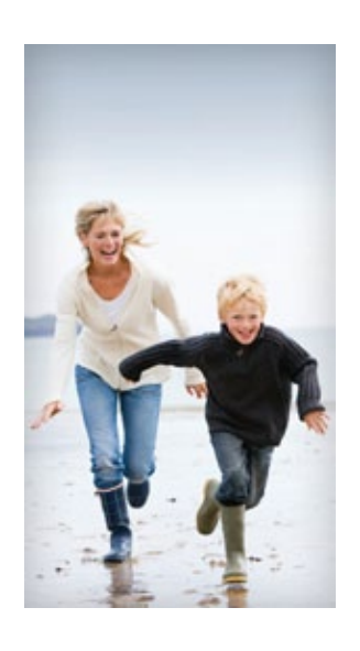
3 things parents should know about 529 accounts.

You can also save for college using other types of accounts, such as regular investment accounts, UGMA accounts, and UTMA accounts. They don't offer tax benefits for saving for college, but the money in them can be used to pay for anything your child needs, including both college and non-college expenses.